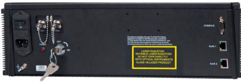
REAR PANEL VIEW