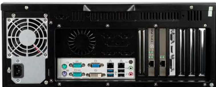
REAR PANEL VIEW