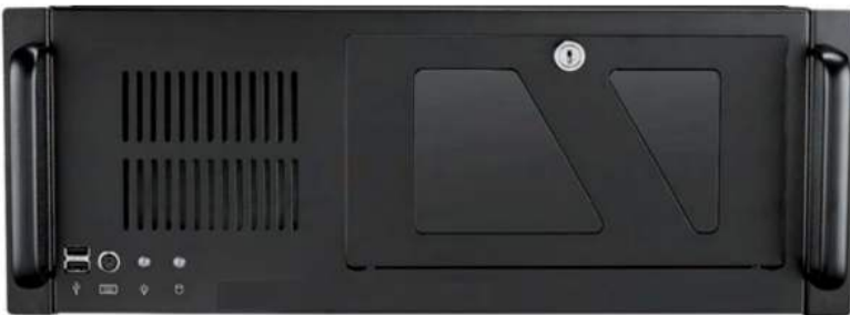
FRONT PANEL VIEW